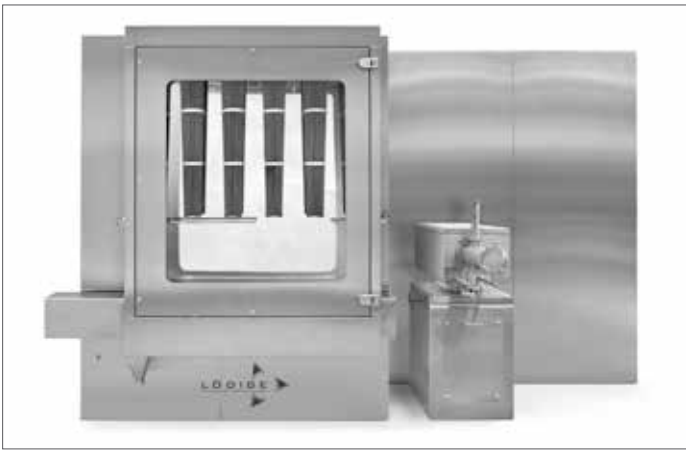
GRANUCON® LCF 5 / CM 5