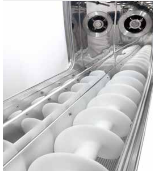
Screw in the fluid bed dryer